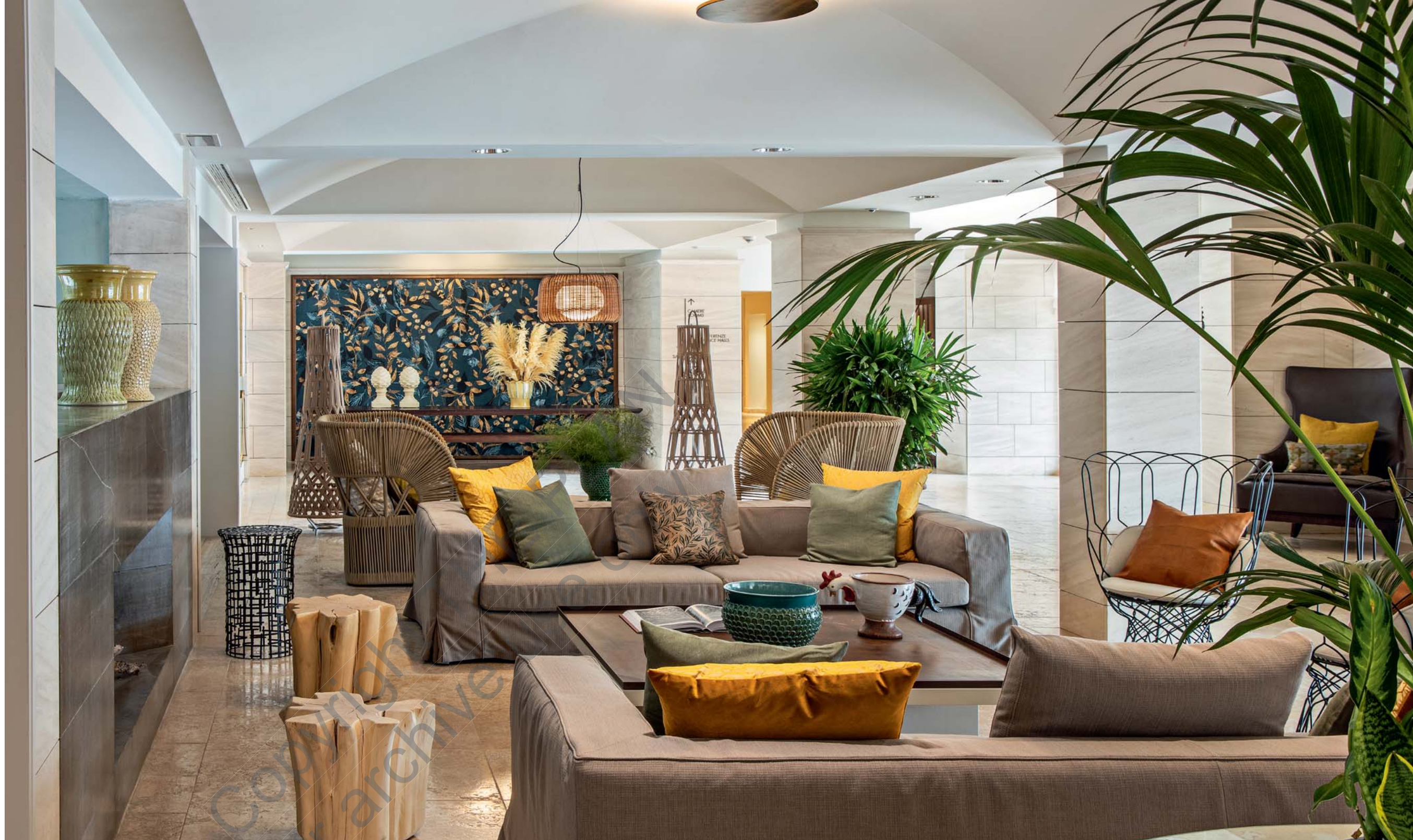
Renovation of the interior at the Terme di Saturnia Natural Destination resort combines classical style and contemporary design, triggering an interplay of references to the surrounding natural environment.

Terme di Saturnia Natural Destination Resort Manciano, Grosseto, Italy